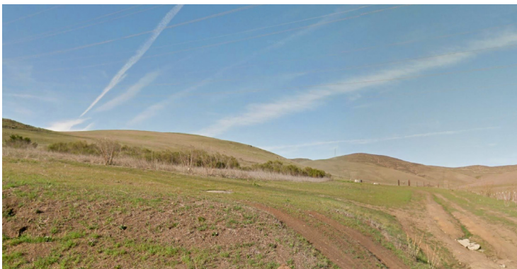
Future Site of the one million gallon per day advanced treatment facility to be constructed on South Bay Boulevard north of Highway 1

The Water Reclamation Facility Program involves replacing the City's existing wastewater treatment plant with an advanced water purification facility that will meet state regulations, protect the environment, and contribute a safe and reliable water source for Morro Bay's homes and businesses. The project will create a drought buffer and will be capable of providing up to 80 percent of the City's water needs in the future.