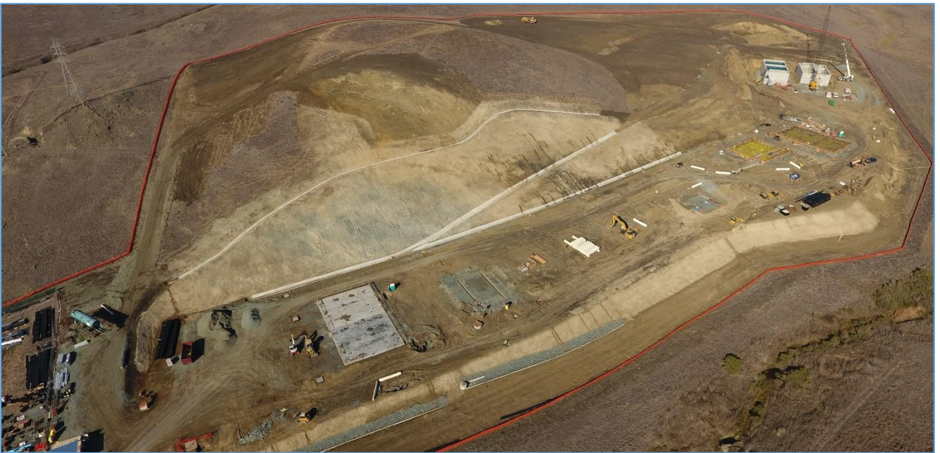
December 31, 2020 – Looking N.W. – Entire Site (Ops Building Slab and South Site Yard Piping Backfilled)