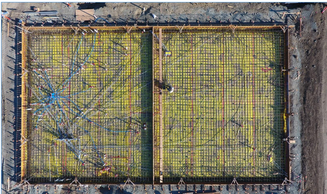
November 24, 2020 – Looking Down at Operations Building Slab (just prior to concrete placement)