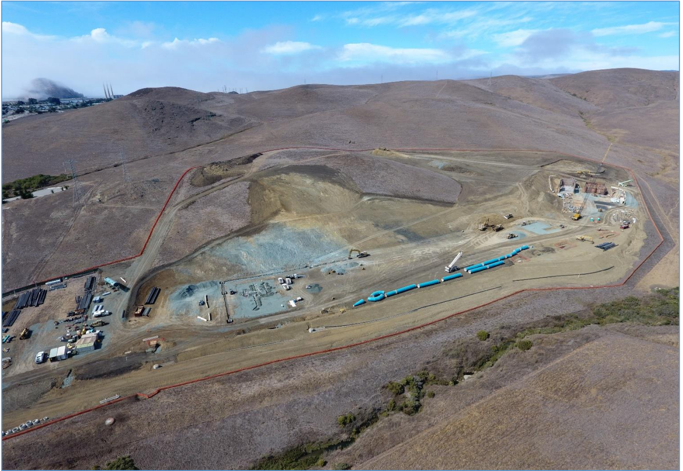
October 10, 2020 – Looking N.W. – Entire Site (Operations Building Area and 78" POW Pipe Delivered)