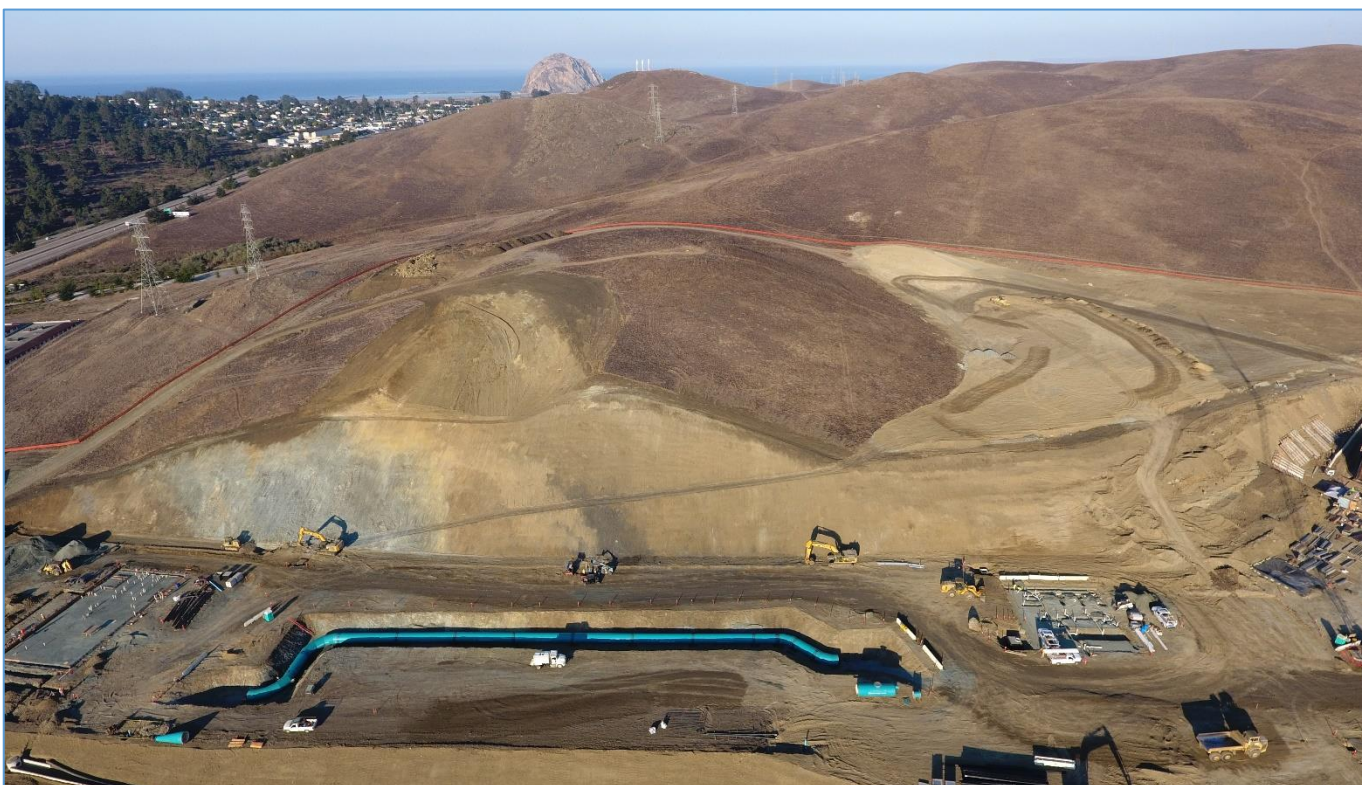
October 29, 2020 – Looking West – 78" POW (Plant Outfall Water) Pipeline (in trench being welded and coated).