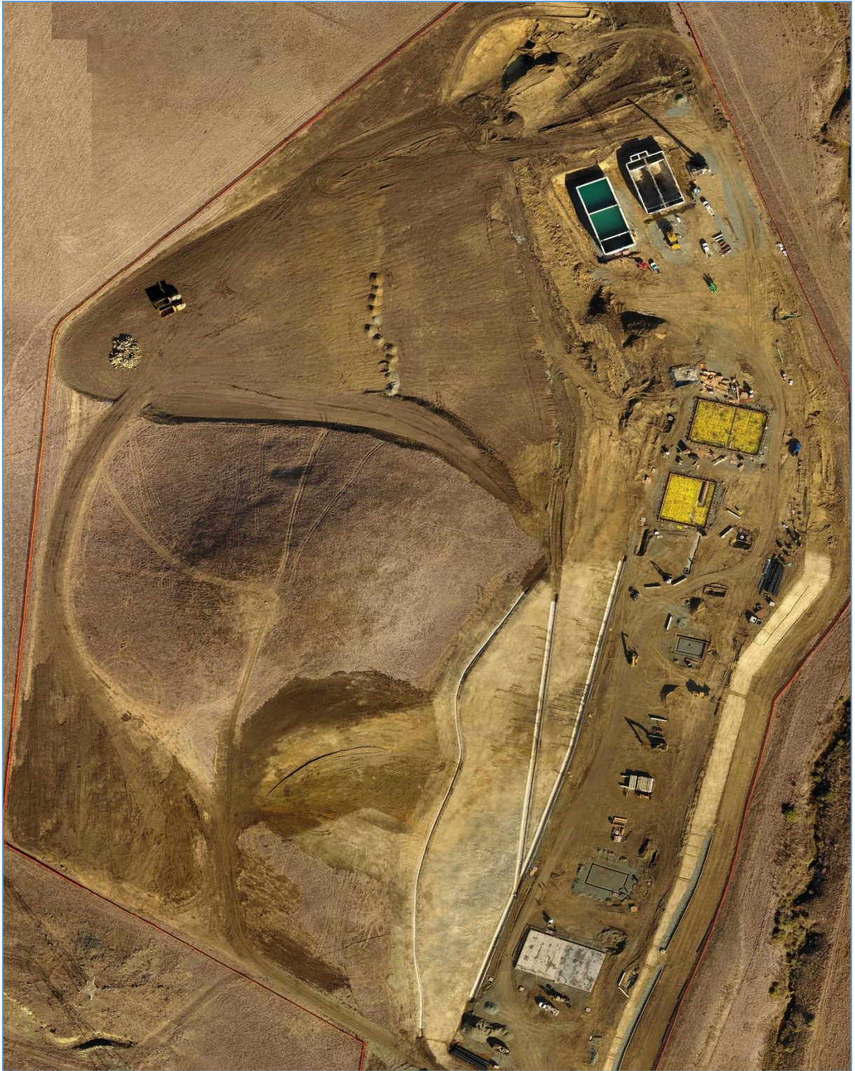
December 31, 2020 – Looking Down at Entire Site