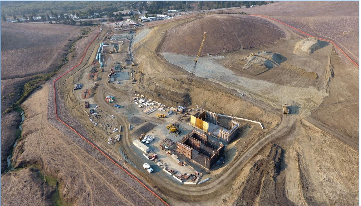
October 15, 2020 – Looking S.W. – BNR Basin and Sludge Holding Tank (Wall Construction in Progress)