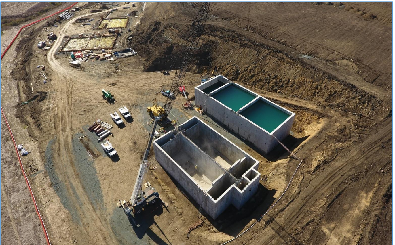
December 31, 2020 – Looking S.W. – BNR Basin (Completed), Sludge Holding Tank (Leak Test in Progress)