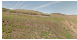
Future Water Reclamation Facility site on South Bay Boulevard.

For more information about Our Water, please visit www.morrobaywrf.com or call 877-MORROBAYH2O (877-667-7622).