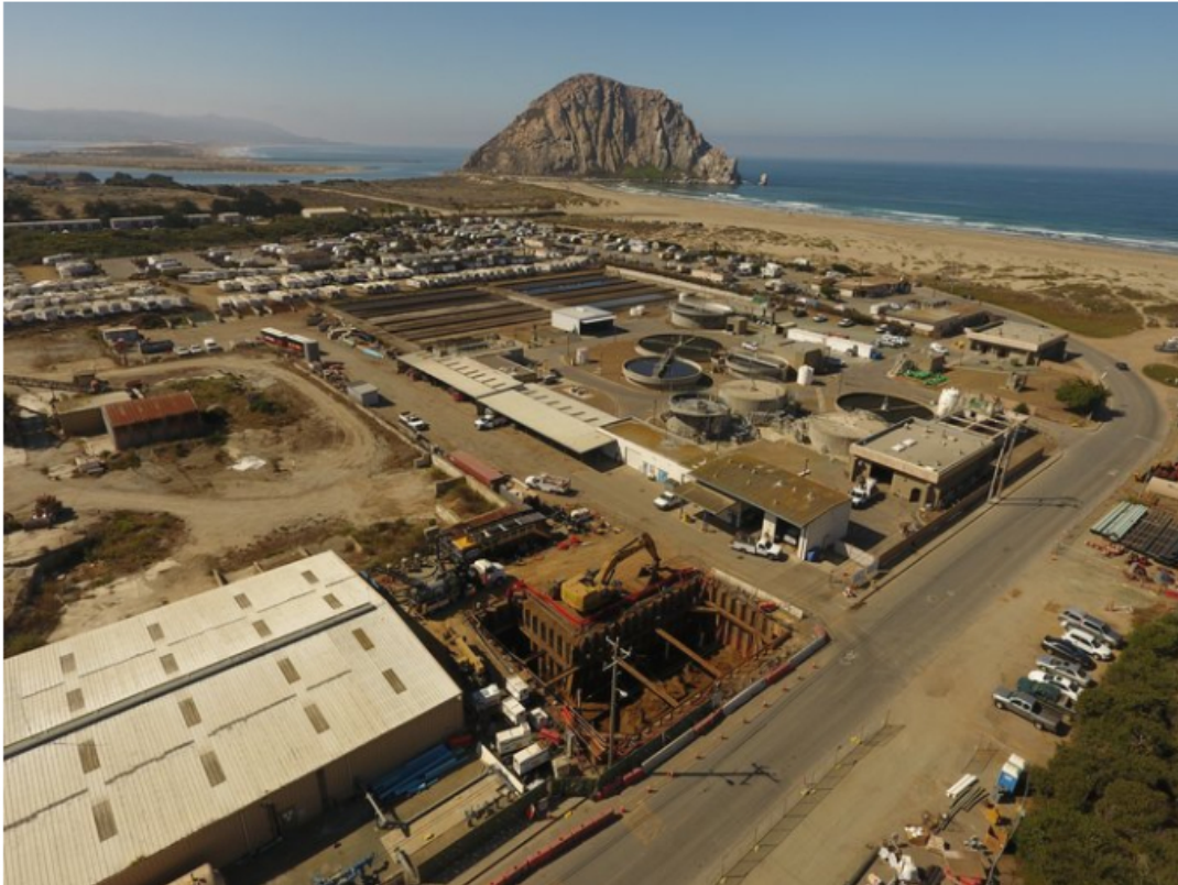
Foundation work is underway on the new pump station near the existing wastewater treatment plant.

Visit the website for current construction notices. Construction is scheduled on weekdays from 7 a.m. to 5:30 p.m.